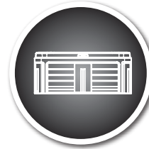
Put in place**