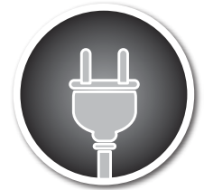
Plug in 120V (convertible 240V*)