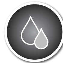
Fill with water