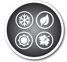
4 seasons insulation