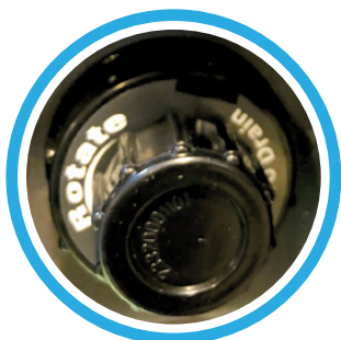
External drain valve

Images for reference only. Colors, specifications and location of the whirlpool* jet may vary (optional).