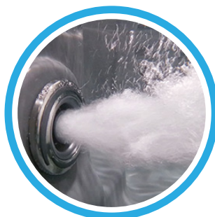
Powerful Whirlpool* jet with water flow management