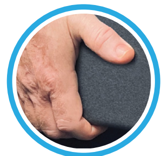
Easy transport with integrated handles