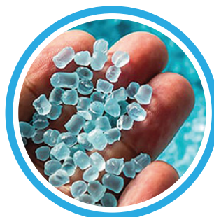
One-piece polyethylene construction